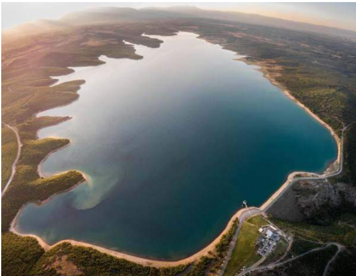
Radoniqi Lake - Gjakove