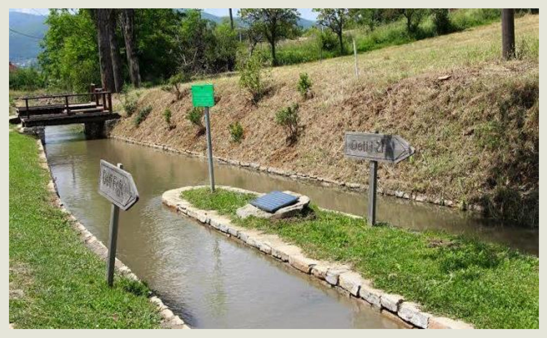
Fig.2 Bifurkacioni(Bifurcation!), Ferizaj