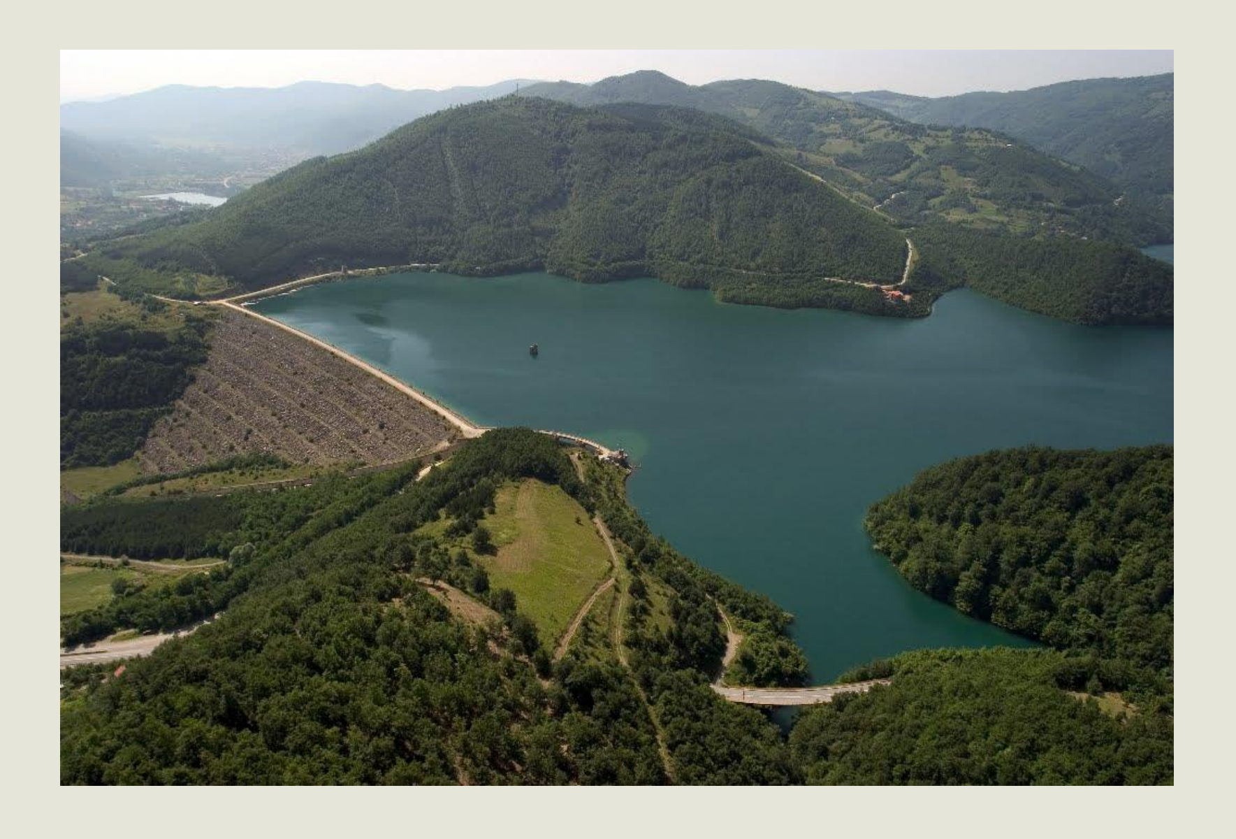
Figure 3 Lake Ujman