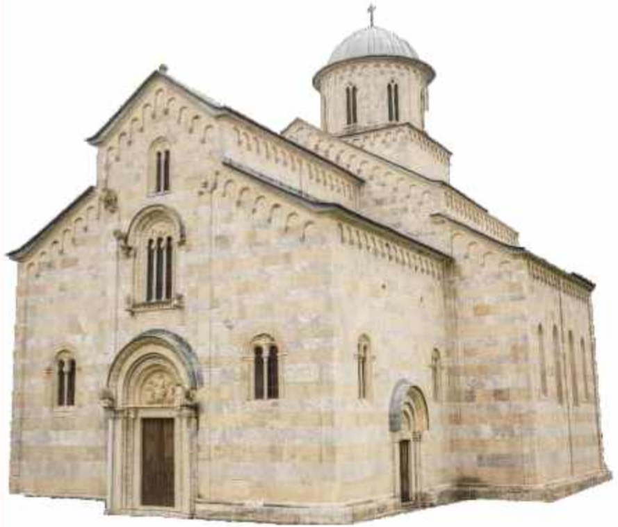
"Deçan Monastery" - Deçan