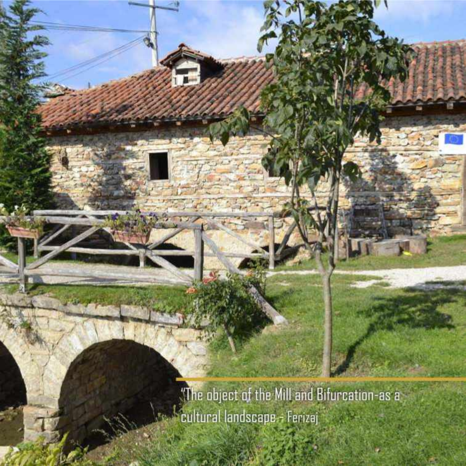
"The object of the Mill and Bifurcation-as a cultural landscape - Ferizaj