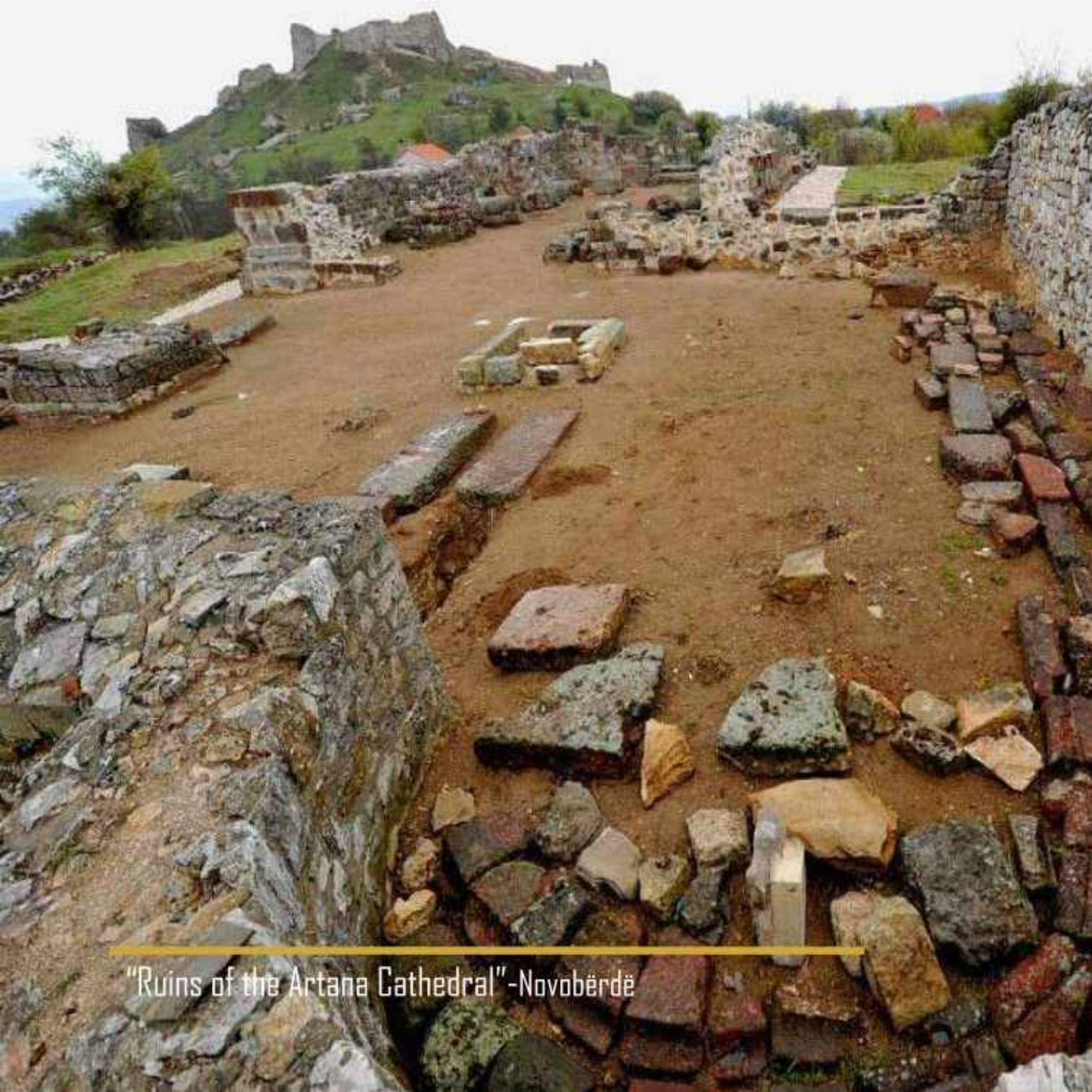
"Ruins of the Artana Cathedral" - Novobërdë