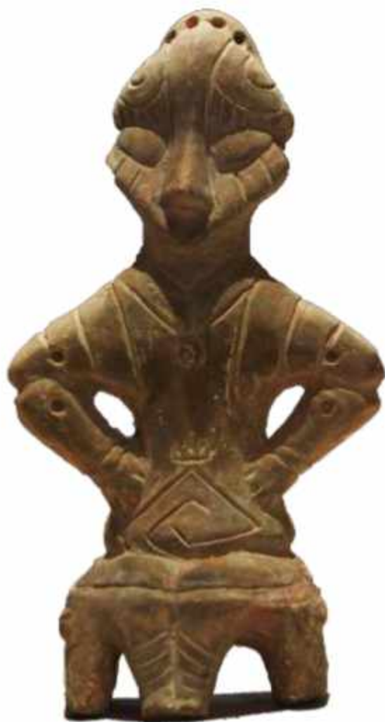
"Goddess on the Throne" - Prishtina