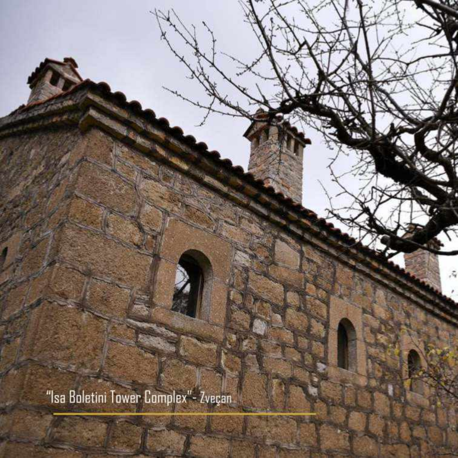
"Isa Boletini Tower Complex" - Zvečan